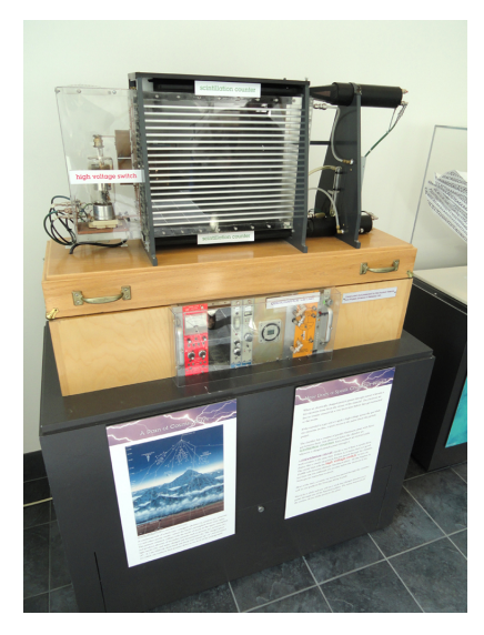
Figure 19.6 A spark chamber is used to trace the paths of high-energy particles. Ionization created by the particles as they pass through the gas between the plates allows a spark to jump. The sparks are perpendicular to the plates, following electric field lines between them. The potential difference between adjacent plates is not high enough to cause sparks without the ionization produced by particles from accelerator experiments (or cosmic rays).